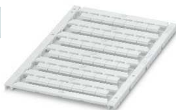
Markers for terminal block widths up to 16 mm