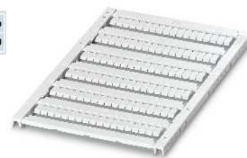
Markers for a terminal block width of up to 6.2 mm